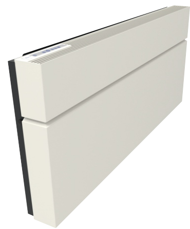
ClimaRad Care H1C